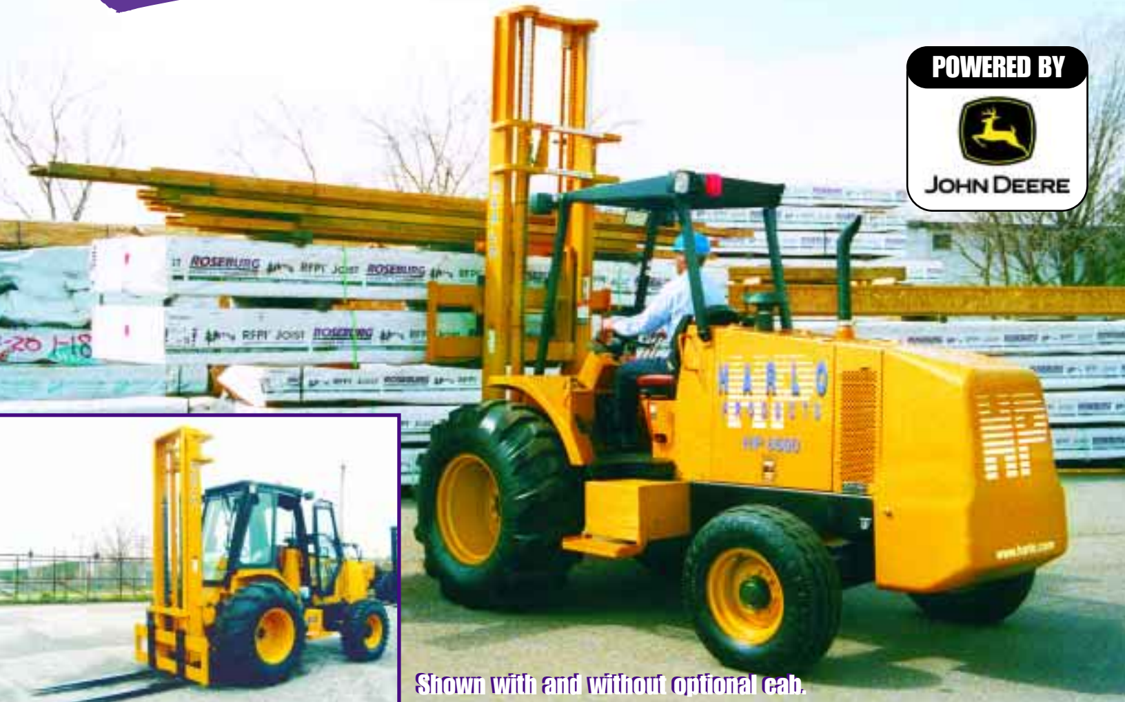
Shown with and without optional cab.